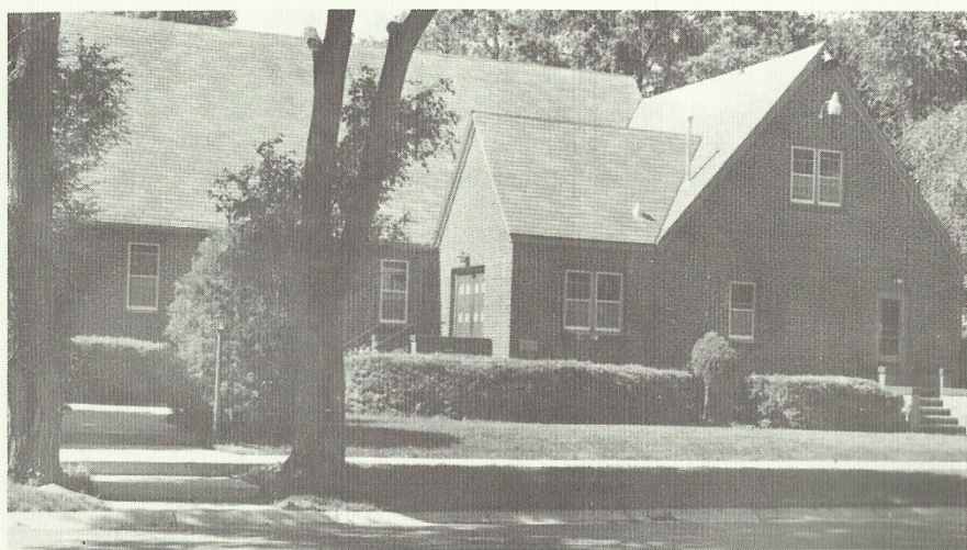
(Present church building)

"And she gave birth to her first-born son and wrapped him in swaddling cloths, and laid him in a manger, because there was no place for them in the inn." (Luke 2:7)