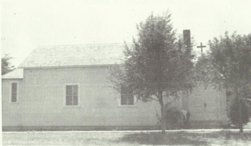
(First church building)

"And she gave birth to her first-born son and wrapped him in swaddling cloths, and laid him in a manger, because there was no place for them in the inn." (Luke 2:7)